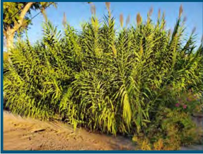
Giant Reed, Canon City