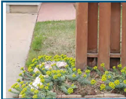
Myrtle Spurge, Canon City