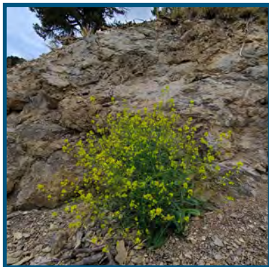
Elongated Mustard, Wellsville