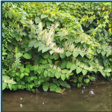
Japanese Knotweed, Canon City