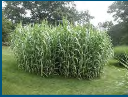
Giant Reed, Florence