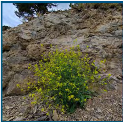
Elongated Mustard, Wellsville